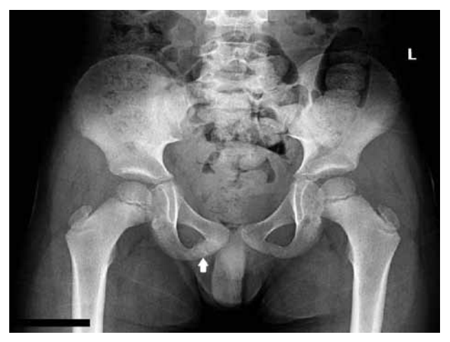
Figure 1. Anteroposterior pelvic radiograph showing enlarged ischiopubic synchondrosis.

swelling and local temperature increase on the knee, pain in knee joint, and pain in hip joint movements. Leukocyte count, ESR, CRP, rheumatoid factor, anti-streptolysin O, and throat culture were normal. Knee MRI showed significant increase of intraarticular fluid and synovial hypertrophy. There were fluid in infrapatellar fat pad and suprapatellar bursa as well. The condition was evaluated as patellofemoral pain syndrome and upper respiratory tract infection after sports activity. Symptoms resolved with rest and non-steroidal antiinflamatory drugs in four to five days.