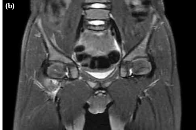
Figure 2. (a) Axial T_2 magnetic resonance image demonstrating ischiopubic synchondrosis enlargement with irregular edges and (b) coronal T_2 magnetic resonance image showing perilesional edema.