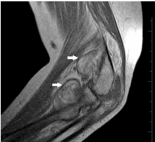
Figure 1. Thirty-year-old patient with pain and swelling of left elbow. Magnetic resonance imaging (sagittal T 1 -weighted) shows high-signal intensity nodular signal changes on anterior proximal radius and anterior distal humerus (arrows). Synovial hypertrophy and minimal degenerative changes with narrowing of joint space are also shown.

Magnetic resonance imaging of the left elbow (Figure 1) was performed and T 1 -weighted MRI showed high-signal intensity, while the short tau inversion recovery images showed isointensity with fat nodular signal changes on the anterior of proximal radius and distal humerus, respectively. MRI of the right wrist demonstrated synovial hypertrophy and effusion in the radioulnar and intercarpal joints. For exact diagnosis and treatment, open synovectomy of the left elbow was performed. Histopathological examination of the specimen (Figure 2) showed infiltration