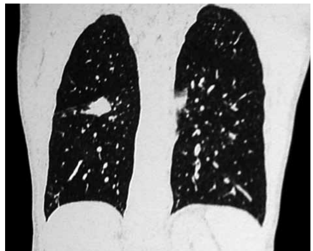
Figure 2. Lumpy, highly dense shadow in the right hilum and scattered small nodules in the left lung.

The association of SLE and MM has been described sporadically in the literature, but the possible pathogenetic mechanisms have not yet been elucidated. 1-14 The pathogenesis of SLE and SS are similar, suggesting that aberrations in T and B cells could lead to polyclonal B cell hyperactivity, hyperglobulinemia, and autoantibody production. However, none of the cases of SLE and MM in the