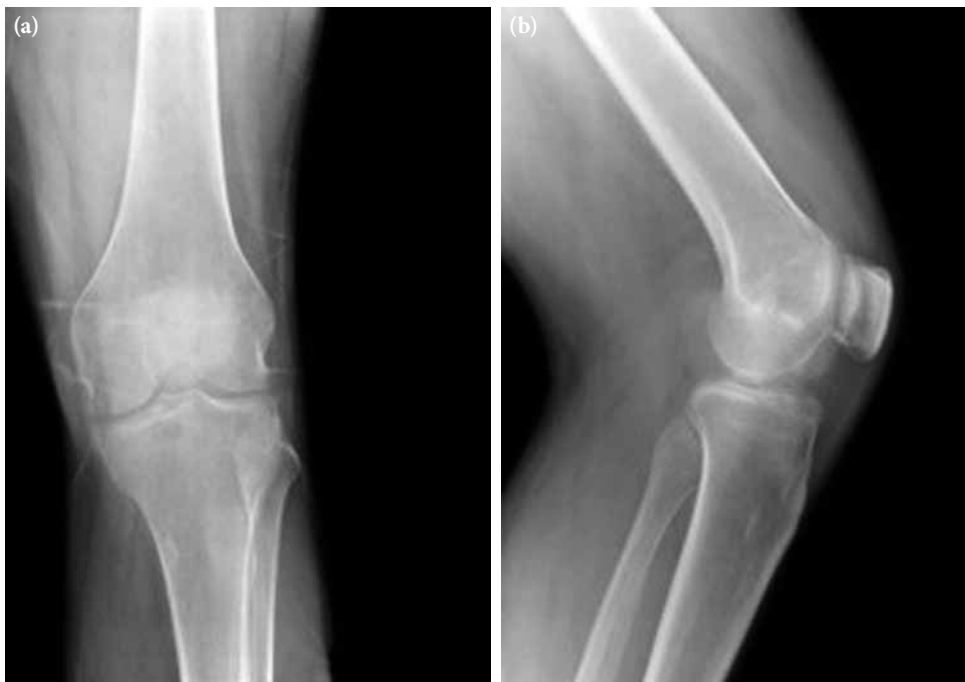
Figure 1. Shows anterior posterior and lateral views of the left knee. There is no abnormality detected.

Gout was not considered as the provisional diagnosis in this case due to the following reasons: 1. Intraarticular tophi lack obvious clinical presentation; 2. The majority of patients with intraarticular gout would have had a history of gout for 10-12 years before the appearance of radiographic lesions or physical findings (Our case was only diagnosed five years previously.); 3. Though it's a rare finding, calcification within the tophi is one of the