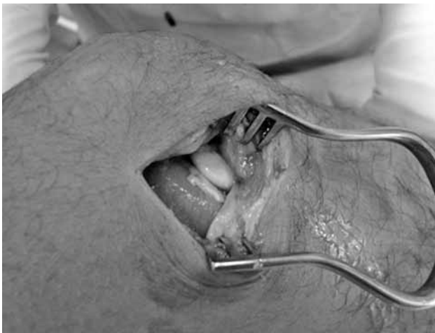
Figure 3. Intra-articular gouty tophi.

the tophi. The cysts may resolve following adequate control of the gout. Osteolysis that occurs in relation to tissue deposits of gout can mimic neoplasm. [6,7,8]