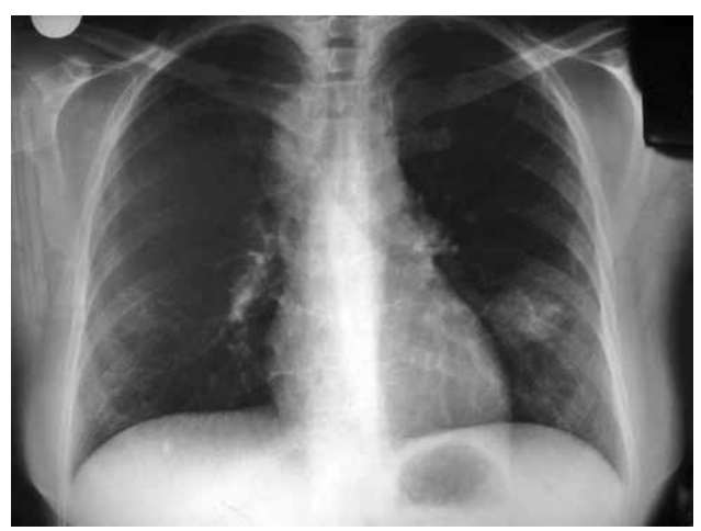
Figure 1. The posterior-anterior chest X-ray demonstrated the bilateral hilar lymphadenopathy.

The laboratory testing results were as follows: rheumatoid factor (RF), 11 U/ml (0-20); erythrocyte sedimentation rate (ESR), 67 mm/h (0-20); C-reactive protein (CRP), 85.43 mg/dl (0-5); and the total blood count, urea, creatinine, and electrolyte values were normal. The hepatitis, antinuclear antibody (ANA) along with the Salmonella and Brucella titers were all negative. The purified protein derivative (PPD) skin and pathergy tests were also negative. No findings were detected on the throat culture or in the direct fecal and parasite examinations. HLA-B27 was negative. A chest X-ray showed the hilar plenitude (figure 1). High resolution computed