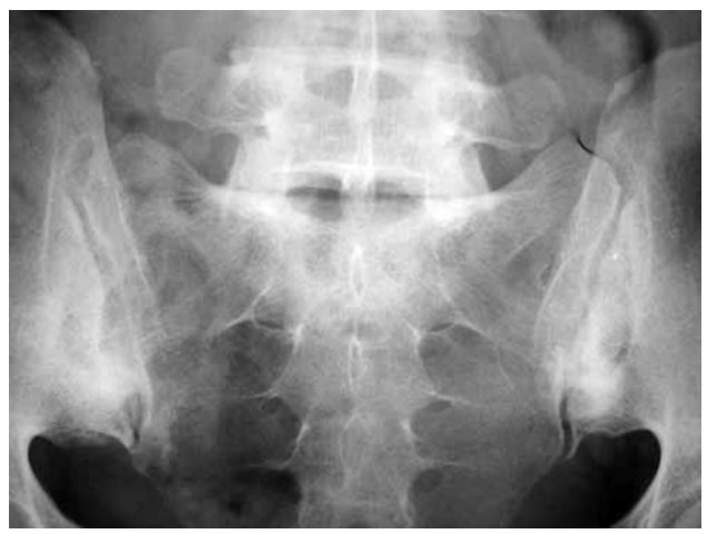
Figure 3. Sacroiliac X-ray showed sclerosis in the inferior regions of both sacroiliac joints.