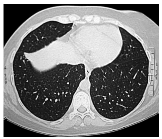
Figure 2. High resolution computer tomography revealed the bilateral hilar lymphadenopathy and multiple mediastinal lymphadenopathy along with several nodules adjacent to several irregular nodules in both lungs. This was compatible with stage II sarcoidosis.

tomography (HRCT) revealed the bilateral hilar lymphadenopathy (LAP) and multiple mediastinal LAP along with several nodules adjacent to several irregular nodules (the largest was 2.5x1.5 cm) in both lungs, which was compatible with stage II sarcoidosis (figure 2). Using a gallium-67 whole body screening method, an activity enhancement in both the hilar and mediastinal regions was consistent with lymph node involvement. The diagnosis of sarcoidosis was confirmed by a bronchoscopic biopsy. A pelvis radiograph and sacroiliac magnetic resonance imaging (MRI) were performed, and the results were normal. The patient was diagnosed as having Löfgren's syndrome, which is a clinical subtype of acute sarcoidosis involving acute arthritis, LAP, and EN. Steroid treatment was administered, and recovery was observed on the arthritis of the right ankle and EN after two weeks. On follow-up, the clinical and laboratory findings (ESR, 35 mm/h; CRP, 7.89 mg/dl) had improved dramatically. During the clinic management of the patient at three months, the patient complained about hip pain, so a radiograph of the sacroiliac joint was performed again. Sclerosis was shown in the inferior regions of both sacroiliac joints on the sacroiliac X-ray (figure 3), and right sacroiliitis was found on the MRI of the sacroiliac joints (figure 4). The complaints of the patient were address by administering nonsteroidal antiinflammatory drugs (NSAIDs), and the patient continued to be followed up.