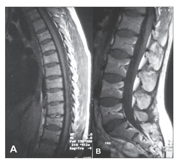
Figure 1. Vertebral compression fractures in A: dorsal, B: lumbar vertebrae seen in the T1-weighed sagittal MRI image of the case 1

Pregnant women complain of low back pain with increasing size of the gravid uterus. Pain starts commonly in the third trimester and it can last until the sixth month after delivery. Low back pain may be secondary to several biomechanical changes in the pelvic joints, ligaments and