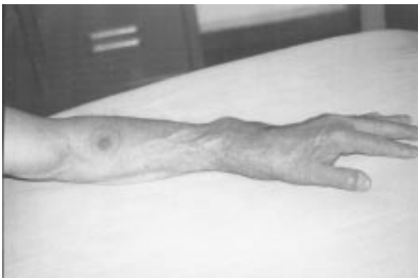
Figure 1: The deformity of the left wrist and the result of the PPD test

Routine laboratory investigations including biochemical tests, complete blood cell count were all normal apart from an elevated ESR (42 mm/h; nor-