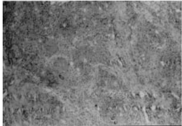
Figure 4: Granulomas composed of epithelioid histiocytes, lymphocytes and scattered giant cells (HE x 40).

A diagnosis of osteoarticular TB was made depending on the clinical, radiological and pathological findings and he was started on antitubercular treatment with isoniazide, rifampin, pyrazinamide and streptomycin. Over a three-month period; his symptoms and functional disability regressed, ESR returned to normal. He continues to follow-up as an out-patient in the clinics of PMR and Infectious Diseases.