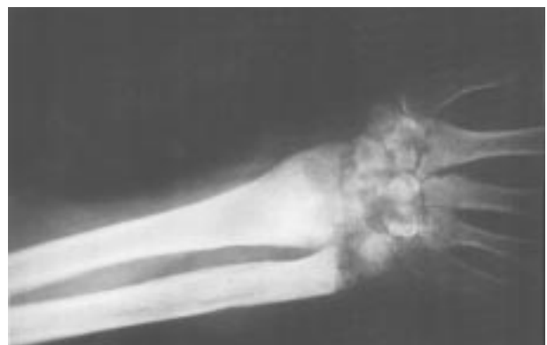
Figure 2: An antero-posterior radiograph of the left wrist indicated soft tissue swelling, joint space loss, gross articular destruction with erosion and cavities through out the carpus, metacarpal bones, ulna and radius, as well as diffuse osteoporosis of the carpal bones.

An antero-posterior radiograph of the left wrist indicated soft tissue swelling, joint space loss, gross articular destruction with erosion and cavities through out the carpus, metacarpal bones, ulna and radius. Diffuse osteoporosis of the carpal bones was also observed (Figure 2). A CT scan of the right wrist showed total disappearance of bony trabecula with marked osteoporosis and cortical cysts and associated with erosive sites in the carpal, metacarpal bones, as well as in the ulna and radius. Extensive effusion particularly lobular and in contact with the wrist joint, and a hypodense effusion