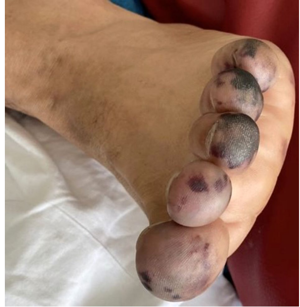
Figure 1. Image showing dusky bluish discoloration of the distal parts of the left foot and a clear line of demarcation between the healthy and the ischemic area.

in the context of COVID-19 and was initiated hydroxychloroquine (HCQ) and his prior treatment was switched for low-molecular-weight heparin