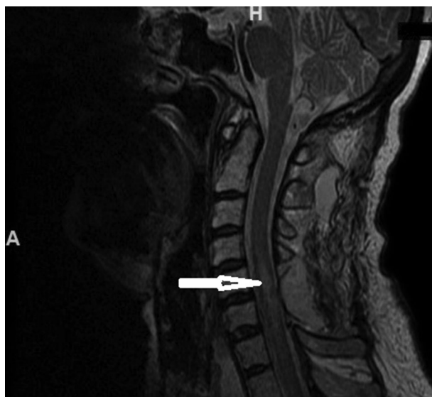
Figure 2. T2 weighted images: Cervical abscess.

ankylosing spondylitis are considered as risk factors for traumatic spinal epidural hematomas due to increased risk for compression fractures. 5 There was no history of trauma in our patient with RA. However, it is known that longstanding RA patients have increased risk for vasculopathy. 6 In addition, oral anticoagulation use is a risk factor for SSEH while the pathology is not clear. Some have argued that the risk of oral anticoagulation associated hemorrhage is not related to the intensity of anticoagulation. 7 There is no absolutely “safe” INR, and it is noteworthy that many of the reported cases were anticoagulated in the therapeutic range. 7 Therefore, any drug interactions altering the bioavailability of oral anticoagulants are important. TCZ inhibits the downregulation of the CYP2C9 which has a major role in warfarin metabolism. Aitken et al. 8 showed that IL-6 induced diminution of CYP2C9 protein level which was greater than that of CYP3A4 in vitro . This suggests that CYP2C9 activity may increase at greater extent than CYP3A4 with TCZ treatment, resulting in increased warfarin metabolism. The authors stated that clinically, this would result in patients requiring a smaller dose of warfarin and a possible need for more frequent INR monitoring.