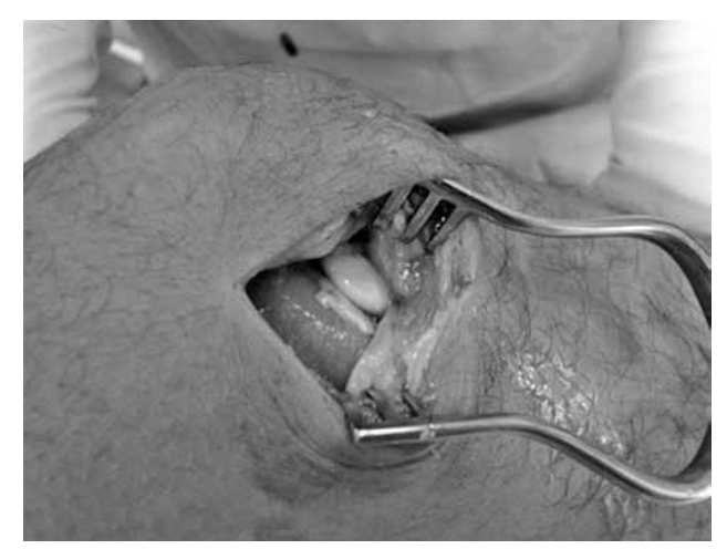
Figure 3. Intra-articular gouty tophi.

the tophi. The cysts may resolve following adequate control of the gout. Osteolysis that occurs in relation to tissue deposits of gout can mimic neoplasm.<sup>[6,7,8]</sup>